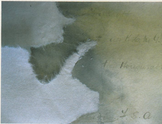
Close-up of Japanese paper infill repair