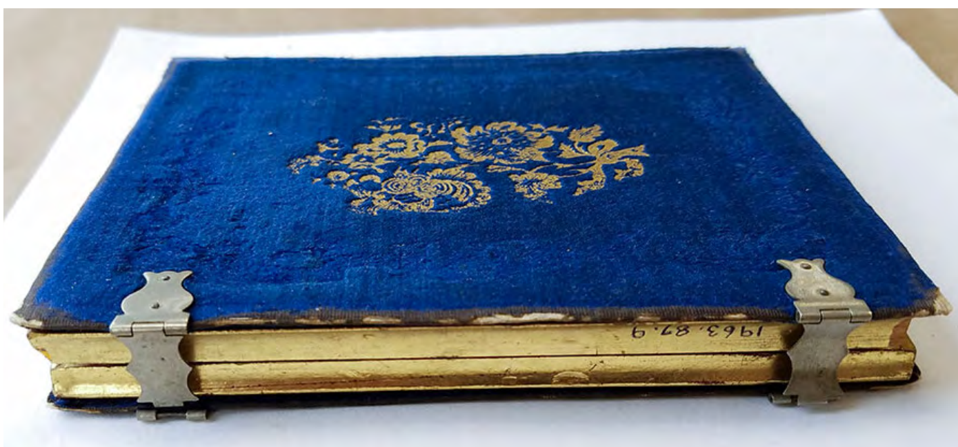
The blue velvet case, which houses the Mathew Brady daguerreotype of Dolley Madison

James Madison died in 1837 and Dolley returned to Washington City in 1844, where she had a significant presence in the capital. She knew all 12 presidents, having taken tea with George Washington, attended the inauguration of James Polk, and met with Zachary Taylor. In her final years, she performed her most symbolic acts and re-