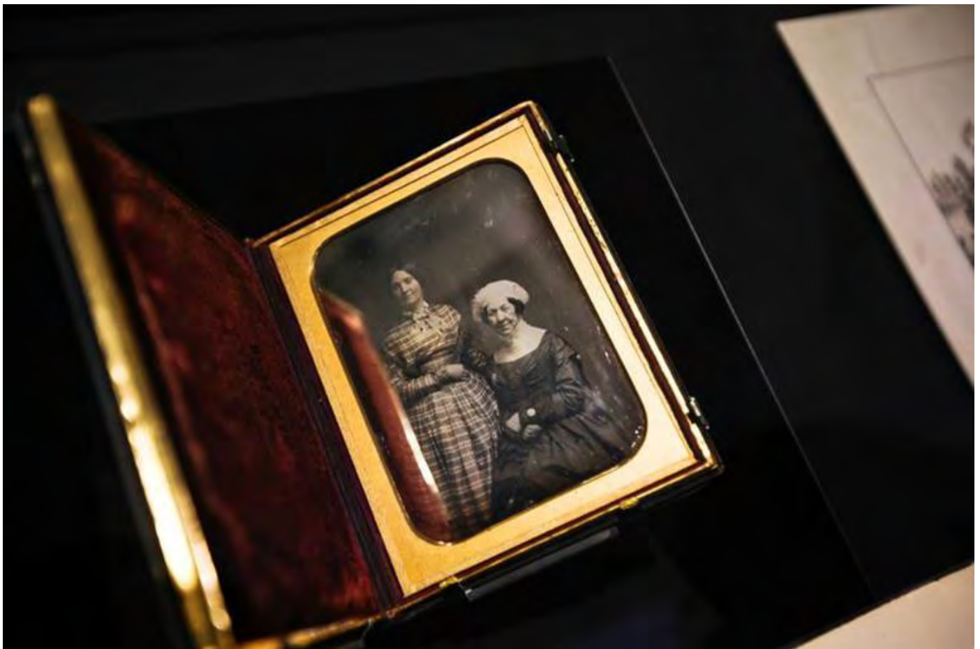
Dolley Madison daguerreotype on exhibit.