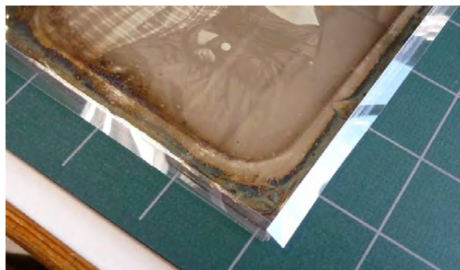
Z-tray housing for daguerreotype plate.

The conservation treatment at NEDCC started with the stabilisation of the daguerreotype plate which included the following: placing the daguerreotype plate in a custom Z-tray made from a polyester sheet that was made