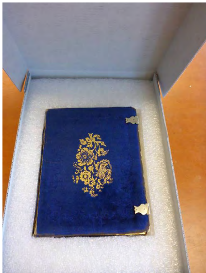
Original housing for the cased image, status prior to conservation.

Since 1963, the quarter plate had been loosely housed in the blue velvet case, which was created to resemble a book. The daguerreotype plate was sealed with a brass mat and cover glass but no brass preserver. The edges of the daguerreotype plate were tarnished. The plate was