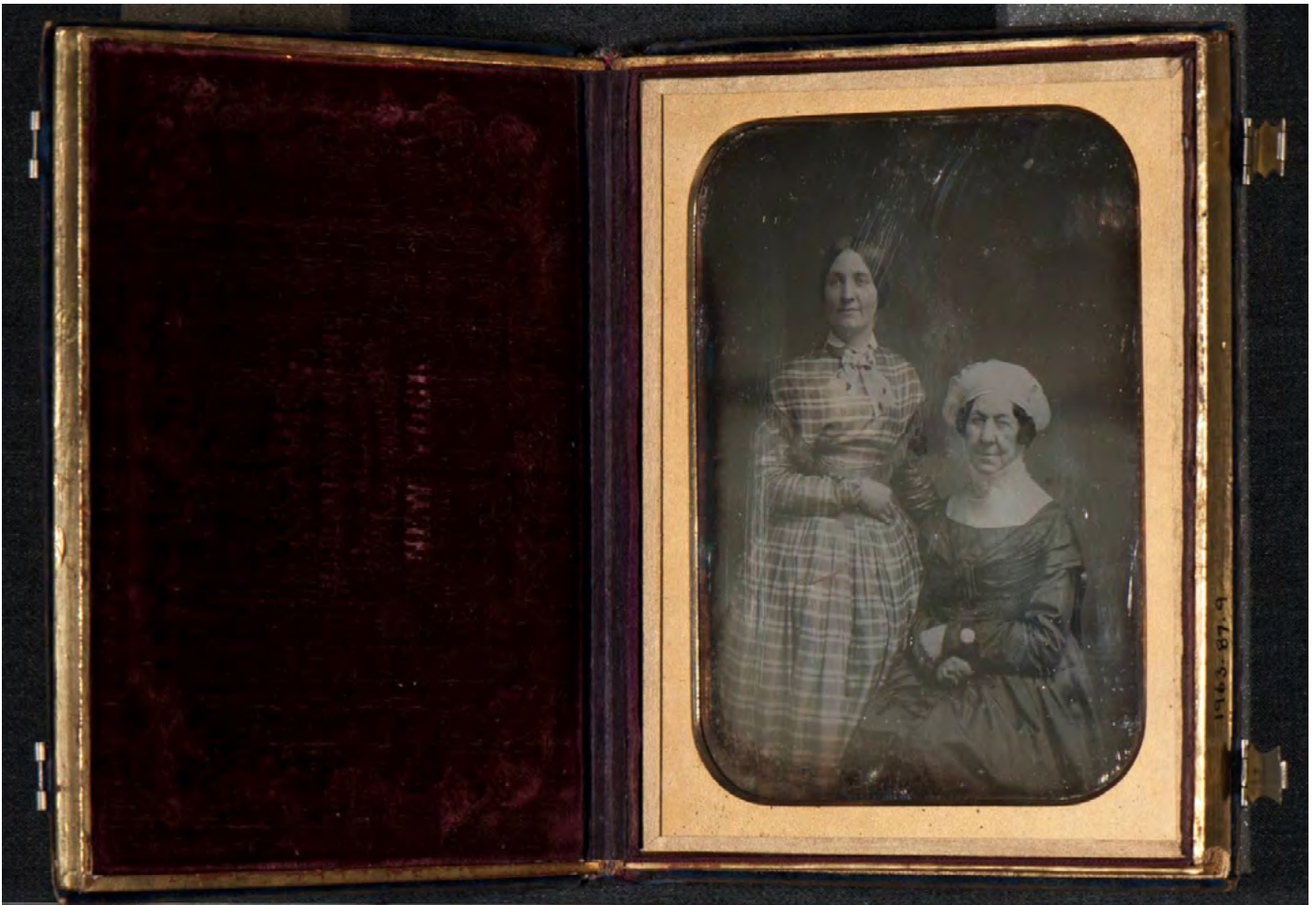
Daguerreotype of Dolley Madison and Anna Causten

ceived her highest honors: sending the first private telegraph message and accepting her own seat in the House.