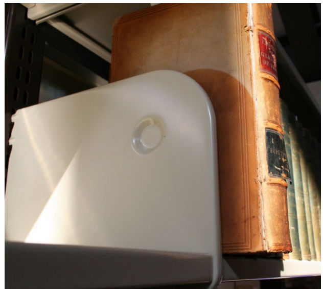
Light damage to leather binding

Molecules, the basic chemical building block of all materials, are in constant motion. On the electromagnetic spectrum, as the wavelengths get shorter, the potential energy increases. When this energy is introduced to the molecules, they vibrate more quickly (they get “excited”) and begin to spread out. Thus, wavelengths that are short (e.g., those from the ultraviolet portion of the spectrum) will increase the vibration of the molecules and encourage them to expand, then cleave, and bond again, which leads to the deterioration of plant and animal fibers. In addition, this re-bonding can change the way that visible light interacts with the material, causing a change in the wavelength of the light and, as a result, we are shown a different color. For example, as a book with a dyed leather cover sits in the sunlight at the end of a shelf, the light causes the molecules in the dye to vibrate more quickly, bump against each other, and change their shape. The light hitting and reflecting off these new molecules changes the speed of the wavelength and thus the color the eye perceives in relation to the dye changes. The general term for this process is photochemical deterioration.