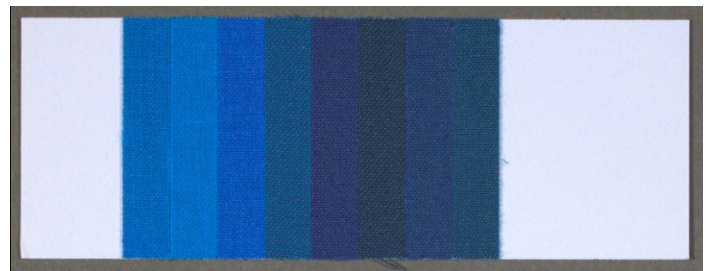
Blue Wool Card

To demonstrate the degree of fading caused by the intensity of light in a particular location, cover half of the card with a light-blocking material to protect it completely from light damage (or cut the card into strips and reserve one as a control). Note the date and set out the Blue Wools in the desired location. Check periodically (every few weeks) to determine how long it takes the various samples to fade. Since the sensitivity of the first few samples on the card corresponds to light sensitive materials such as watercolors and textiles, the results will give you a general idea of the amount of damage you might expect if materials were exhibited for the same period of time at the current light level in that location.