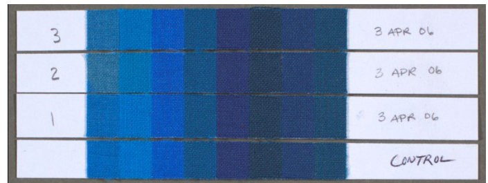
Blue Wool Card in strips and dated

In most cases, a general correlation between the sensitivity of the artifact and the Blue Wool standard's scale will be sufficient for informed decision-making.