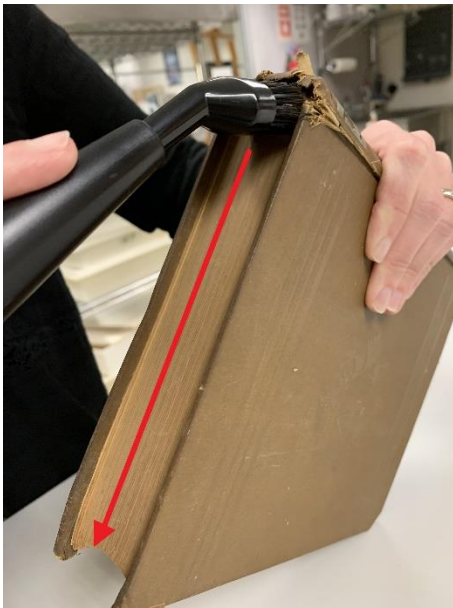
Cleaning the head of the book