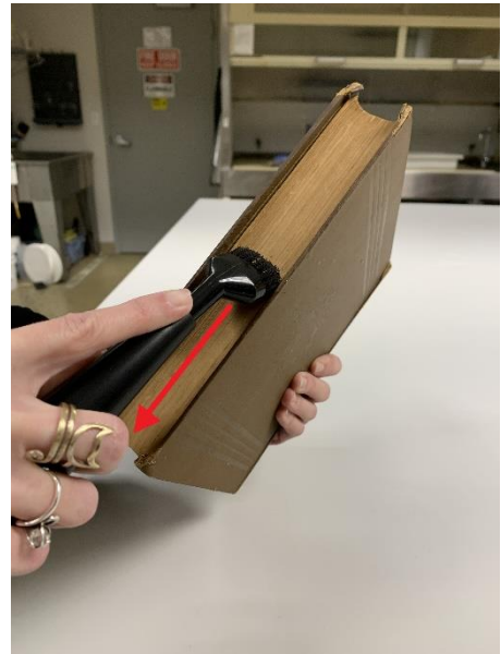
Cleaning the fore edge of the book